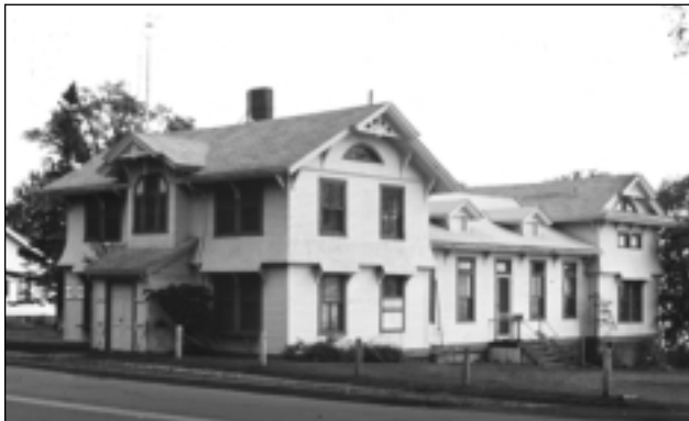
The U.S. Fisheries Station/Limnological Research Station in Duluth (1885), an example of Shingle style architecture.