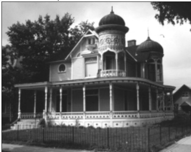
An example of exotic influences: the Bardwell-Ferrant house in Minneapolis (1883, altered in 1890); above, front view; right, detail of tower.

As a result, virtually everything in the way of design elements from the last century is again available. It is difficult for the amateur restorer to resist the lure of the popular market, which always tends to embellish beyond the original design. Before undertaking a project, one must become thoroughly acquainted with all aspects of the time, tastes, and social and economic circumstances of which the building is a product. Only then can the project be put into perspective and judgments be made with credibility. A good rule is, “Resist the temptation to create a historical image that never existed.”