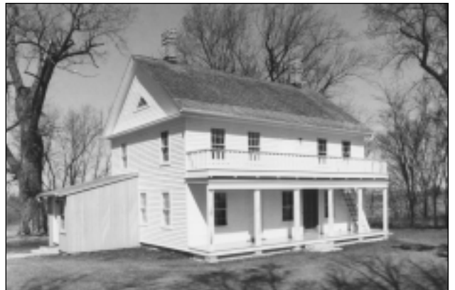
SHPO file photo