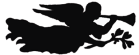
Hennepin History Museum

Pieces of the past – continued on page 2