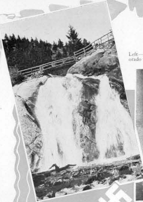
Left—Helen Hunt Falls, Colorado Springs, Colorado.