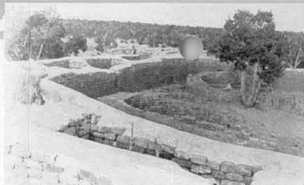
Remains of Sun Temple, Mesa Verde near Cortez, Colorado.