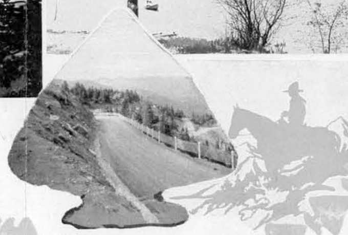
Above, Left—Pike's Peak from Palmer Park, Colorado Springs.