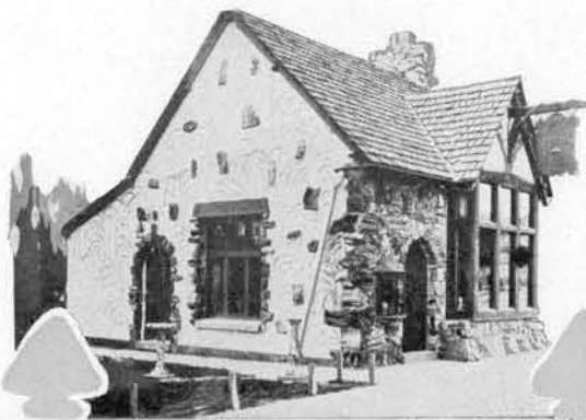
Arterrafts Studio Custer, South Dakota

Midland PINE CLEANSER for general cleansing operations. A delicate odor of pine remains a short while after use.