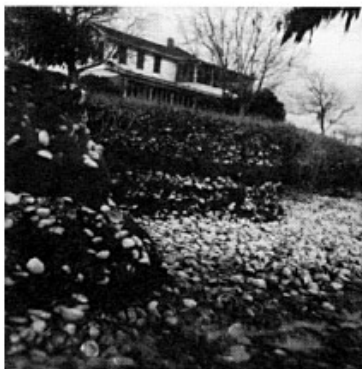
Figure 1. A shell midden deposit

These factors allow chemical weathering and leaching to occur. For example, burning or calcinations of shell during food or artifact processing prior to discard leads to poor preservation. The habitat of the mollusk may also be important to preservation after death. The shells of some terrestrial gastropods that live on calcium-depleted soils may be thin and easily broken, and pelecypods that live in brackish or marine environments rich in calcium ions will be very well preserved. Although there are technical