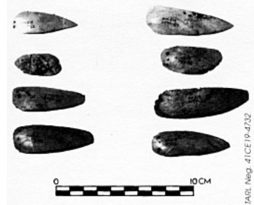
Figure 4. Shell artifacts. Note the deteriorated surface on the lower shells.

any kind, as it can stick to the surfaces and pull off materials when removed. Mark the plaster bandage jacket after it sets up completely with whatever information is necessary to inform someone on how to remove the jacket safely. It also must be marked with lot/catalog/accession and what other numbers are needed to maintain provenience.