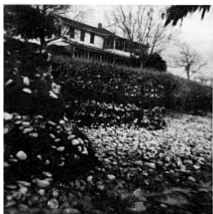
Figure 1. A shell midden deposit

Shell has been used as a material for ornaments in the New World at least since the Archaic stage, perhaps reaching an artistic apex during the Mississippian period in Midwestern and Southeastern North America, therefore, the need for