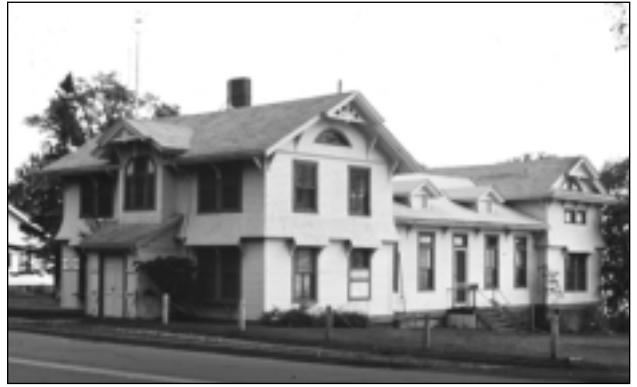
The U.S. Fisheries Station/Limnological Research Station in Duluth (1885), an example of Shingle style architecture.

architectural historians attribute its introduction to Cass Gilbert) and remained in fashion through the turn of the century.