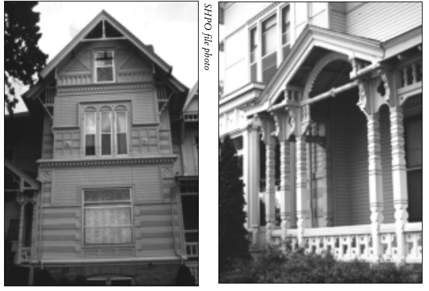
Above, left: front of the George W. Taylor house (1890) in LeSueur, an example of the Eastlake style; right: a detail of a side porch in the Taylor house.

lumber is readily available, they are mainly of frame construction. The frame is sheathed with clapboards, and overlaid with horizontal, vertical or diagonal boards dividing the wall surface into panels. Eaves at the roof lines project considerably and are usually supported by large brackets, which, together with the stick work, sometimes give the building the appearance of a Swiss chalet. The open porch or verandah is a common feature; roofs are supported by posts (rather than the more common column) with diagonal braces. Polychromatic paint schemes are employed to enhance the stick work patterns.