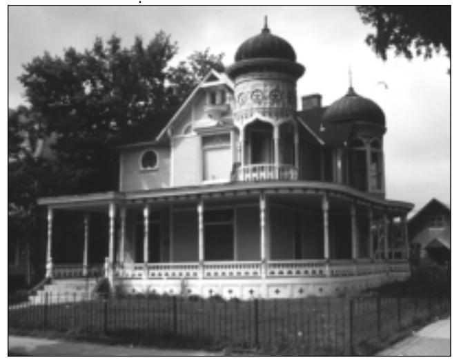
An example of exotic influences: the Bardwell-Ferrant house in Minneapolis (1883, altered in 1890); above, front view; right, detail of tower.

Another influence on late 19th-century architecture that can be traced to the Centennial