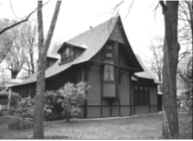
The C.P. Noyes Cottage in White Bear Lake, an example of Stick style architecture. (1879)

Andrew Jackson Downing had hinted at the Stick style in his publication Country Houses (1861), and many Stick style buildings are often also called Gothic. Their primary design characteristic is the use of exposed stick work, which is more often applied than structural in nature. Proliferation of the Stick