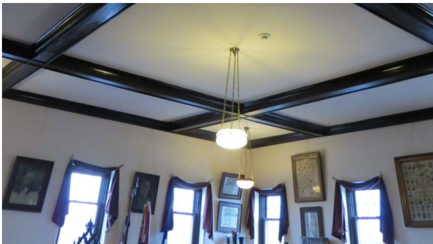
LABELED PHOTO EXAMPLE: