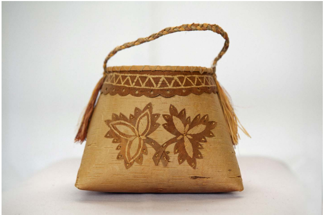
OJIBWE ARTIFACT 6 FROM “IMPLEMENTING THE OJIBWE EXHIBIT,” MINNESOTA DISCOVERY CENTER