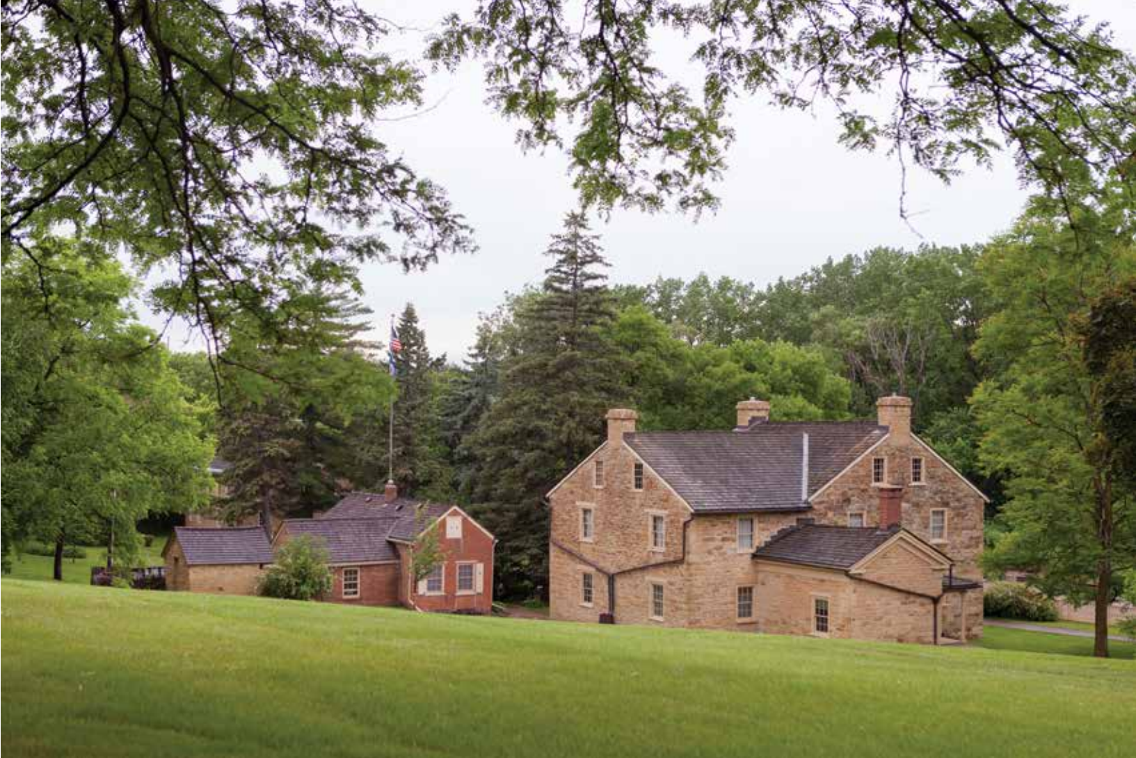
Sibley House Historic Site, one of three historic sites supported by the DeLeo challenge in FY14.