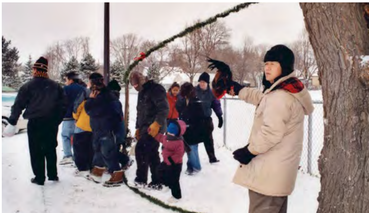
Above (top to bottom): 1894 - 1957.