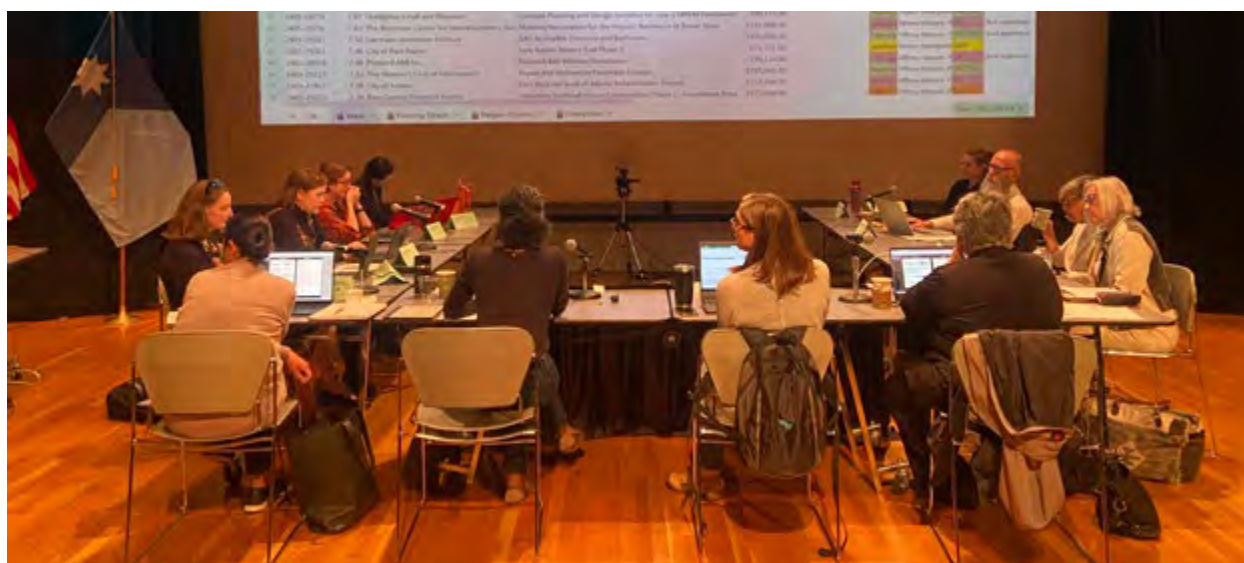
Above: The Historic Resources Advisory Committee (HRAC) meeting at the Minnesota History Center on September 26-27, 2024.