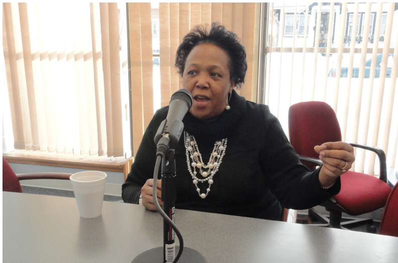
Photo Tips for Your Grant Process

Get “action shots” of your subjects as they are being interviewed for your oral history project.