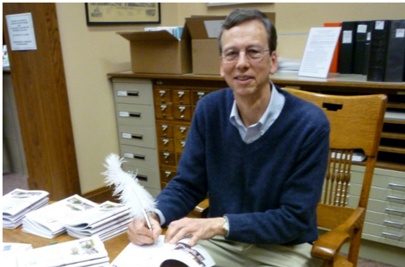
Photo Tips for Your Grant Process

Book signings or speaking events are great opportunities to photograph the author.