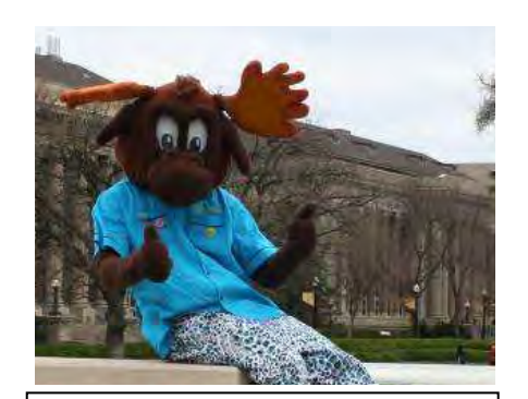
Mooster History gives the Daily Bulletin "Two Thumbs Up!"