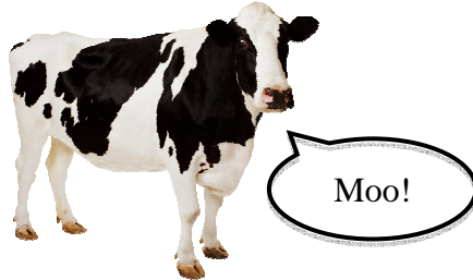
Don't forget to make friends with the rest of the herd!

History Day Campers and their family and friends can also become fans of "Minnesota History Day 2012" on Facebook. We will be posting up-to-date travel information and national plans for campers to follow. There will also be a discussion forum for students to share their plans, talk about their projects and boast about their amazing room decorating schemes.