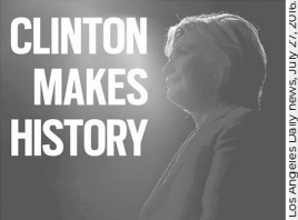
DEMOCRATS NOMINATE FIRST WOMAN TO RUN FOR PRESIDENT Headline from Clinton's presidential nomination.

"Men are saying perhaps 'Thank God, this everlasting woman's fight is over!' But women, if I know them, are saying, ' Now at last we can begin. '... Now they can say what they are really after; and what they are after, in common with all the rest of the struggling world, is freedom." -Crystal Eastman, 1920 speech following the ratification of the 19th amendment