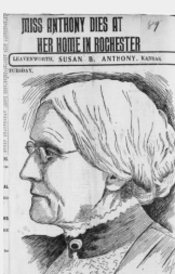
Susan B. Anthony Scrapbooks, 1905-1906. Library of Congress.