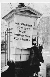
Alison Turnbull Hopkins, 1917.