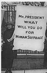
The First Picket Line, 1917.