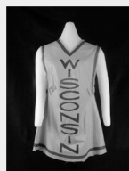
Parade Tunic, 1916.