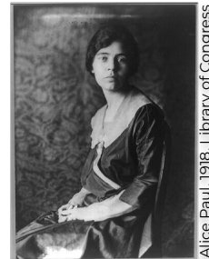
Alice Paul, 1918