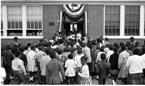
African American school children entering the Mary E. Branch School at S. Main Street and Griffin Boulevard, Farmville, Prince Edward County, Virginia. Farmville Virginia, 1963. Sept. 16. Photograph.