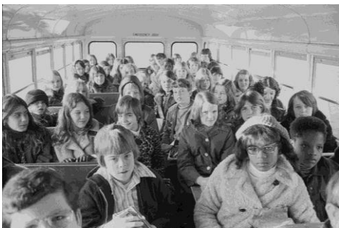
African American and white school children on a school bus, riding from the suburbs to an inner city school, Charlotte, North Carolina. Charlotte North Carolina, 1973. Photograph. (Accessed March 02, 2018.)