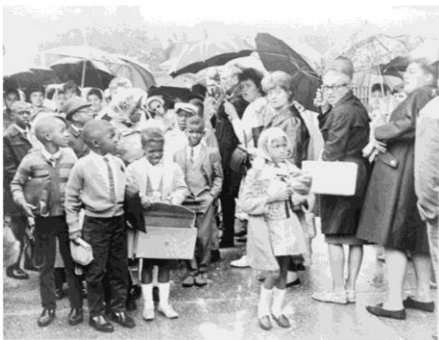
African American children on way to PS204, 82nd Street and 15th Avenue, pass mothers protesting the busing of children to achieve integration. New York, 1965. Photograph.