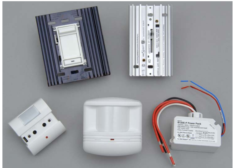
Fig. 1: Among components of a system to reduce the intensity and duration of light on sensitive artifacts are (top row) dimmer switches and (bottom row) occupancy sensors with power pack.

Let's say your museum is open six days a week for seven hours a day, 52 weeks a year. And let's say that the light illuminating that wedding dress in your permanent exhibit measures 200 lux. Assuming that the light remains on during museum hours, in one year the