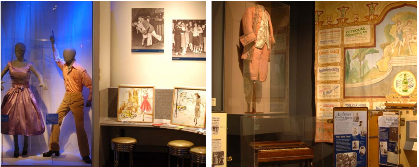
Figs. 4 and 5: When an occupancy sensor detects motion in the exhibit gallery, lights on the second circuit of the two-circuit system come on to boost lighting to a level sufficient for viewing all objects comfortably.

control zones. A front-and-rear or side-to-side arrangement is the easiest to manage. Consider creating additional spot zones for prominent or particularly sensitive artifacts in the exhibit.