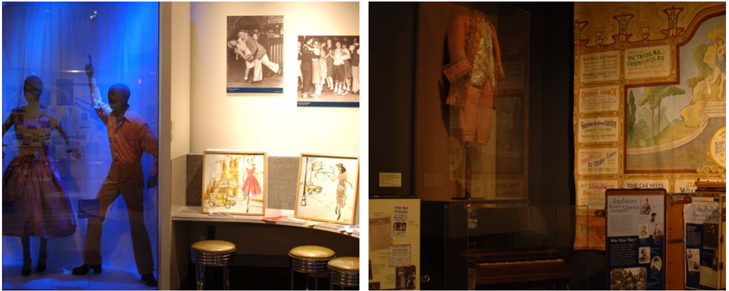
Figs. 2 and 3: In a two-circuit track lighting system with an occupancy sensor on only one circuit, the circuit without sensor provides a constant level of light. You may choose a combination of minimal lighting on sensitive artifacts with bright light for nonsensitive areas (left) or a uniformly low level of light throughout (right).

Reducing the duration of light exposure is probably the most beneficial and cost-effective measure you can take to minimize its damaging effects. Among the strategies you might use: