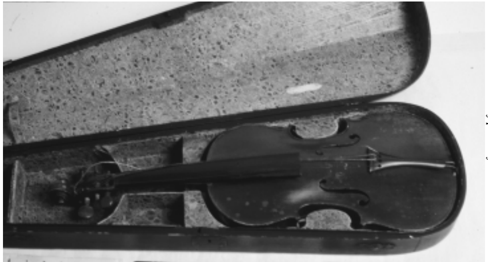
Fig. 1: This violin from the Minnesota Historical Society's collection, dating to the 1850s, had loose strings and a missing bridge.

coniferous trees – is chosen for its sound qualities, durability, regional availability and appearance.