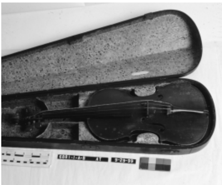
Fig. 2: Repairs to the violin in fig. 1, including a new bridge, brought new life to an artifact from Minnesota's territorial days.

Wood can be found in many familiar forms in musical instruments – from drum bodies and sticks to the violin family and other stringed instruments (see figures 1 and 2). The type of wood used for a particular instrument – whether hard wood from deciduous trees or soft wood from