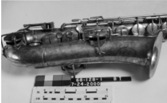
Fig 5 (left): A silver-plated saxophone dating from about 1900 showed overall tarnish.