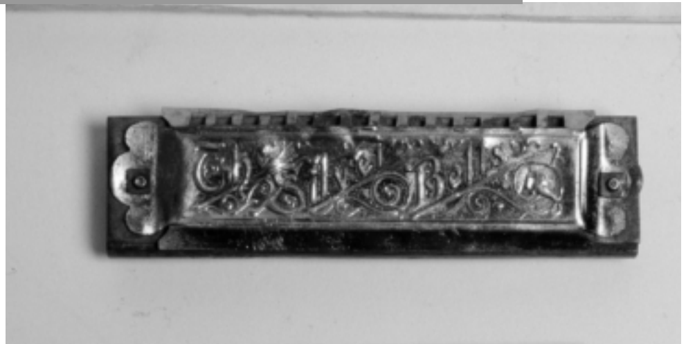
Fig. 4: After stabilization treatment of the metal and wood components, the harmonica from fig. 3 was reassembled.

cleaning and polishing also can introduce corrosive chemicals such as ammonium hydroxide, which reacts with copper alloys such as brass. The rate at which corrosion occurs depends on temperature; objects corrode faster at higher temperatures. For example, silver tarnishes twice as fast at 84 F as it does at 64 F.