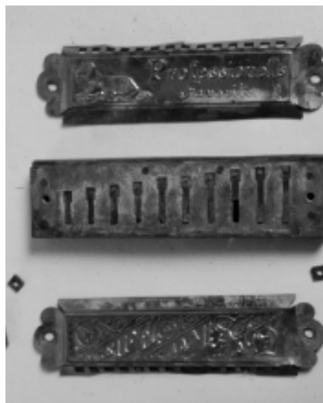
Fig. 3: The lead alloy reeds inside this harmonica were severely corroded. To stabilize the instrument, it was disassembled for cleaning and coating.

Metals are less vulnerable to breakage and the common deterioration factors that affect organic materials. The most prevalent problem experienced by the metal components of musical instruments is corrosion – the reaction of refined metal with water or water vapor, oxygen and mineral salts. Improper