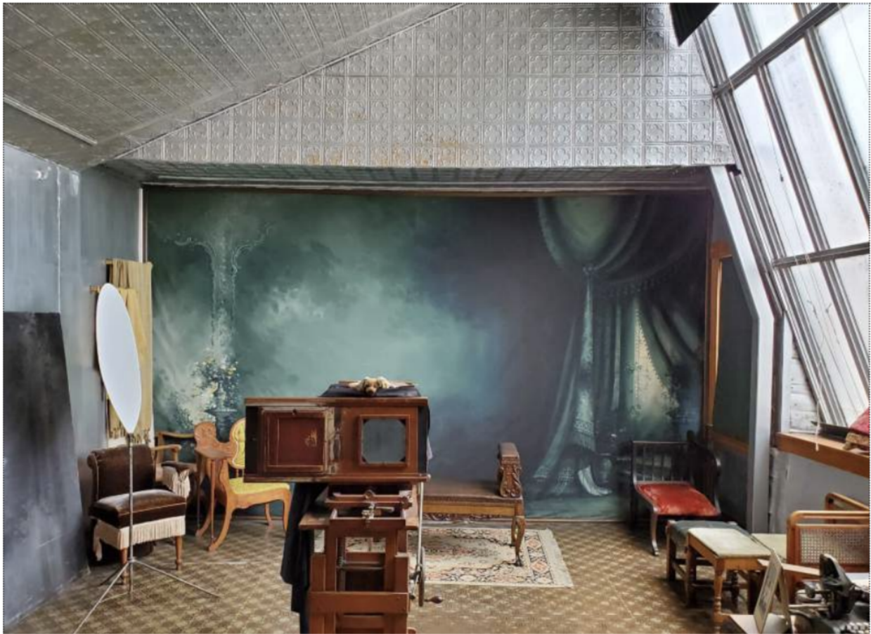
FROM THE CONDITION ASSESSMENT REPORT, GUST AKERLUND PHOTOGRAPHY STUDIO, CITY OF COKATO