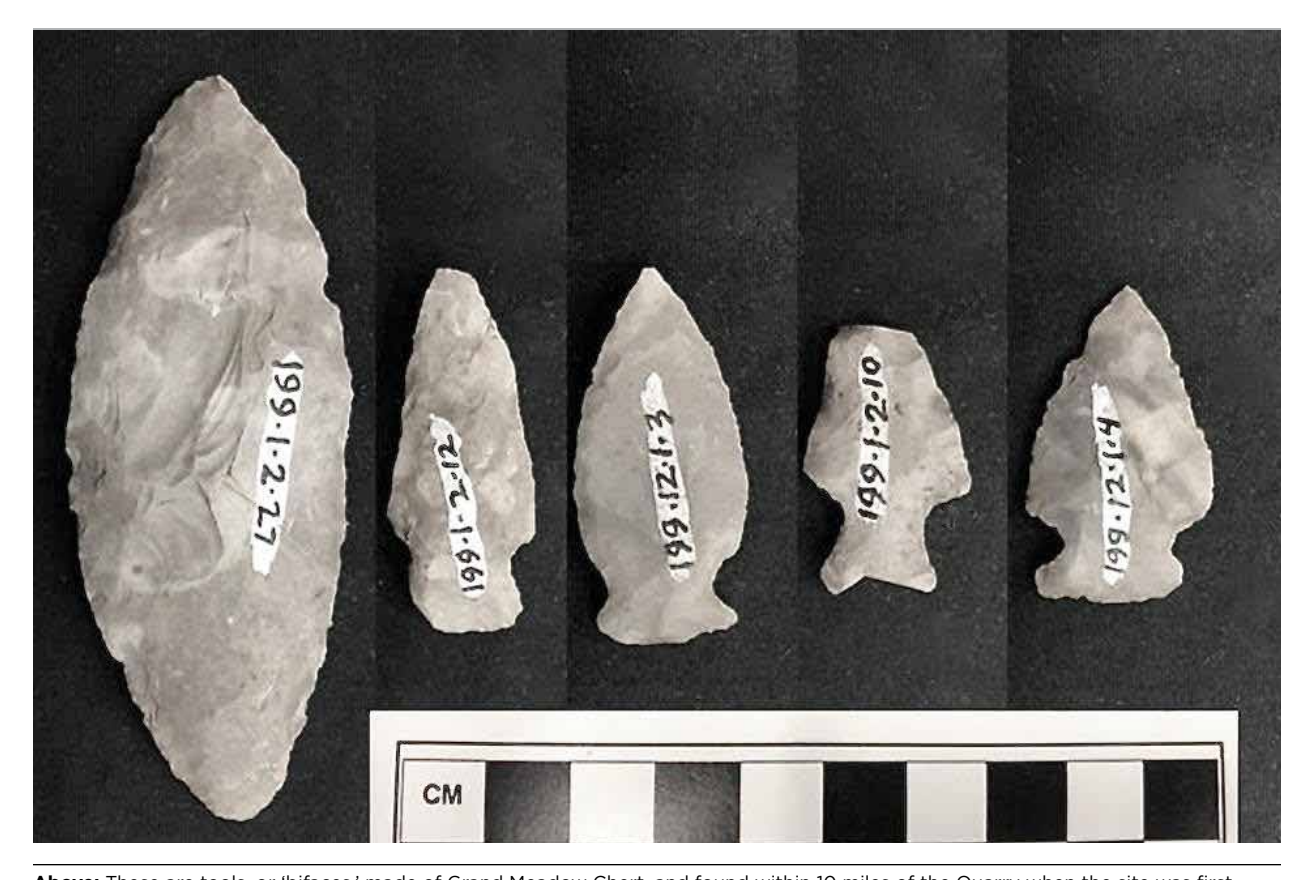
Above: These are tools, or 'bifaces,' made of Grand Meadow Chert, and found within 10 miles of the Quarry when the site was first recorded in 1980 during the Statewide Archaeological Survey. From the MNHS Collections.